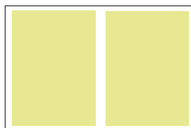
Double Image Front